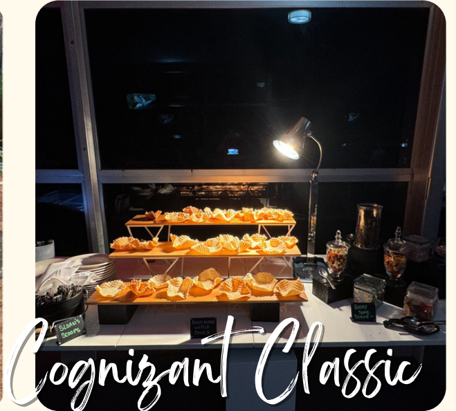
The Cognizant Classic