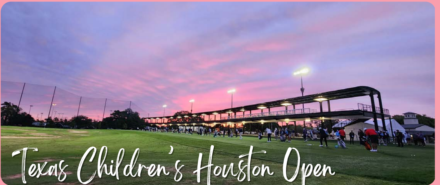
Texas Children's Houston Open